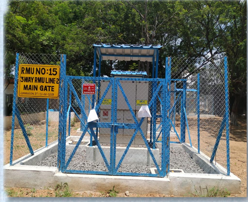
Commissioning of RMU under LT Package at Ramagundam completed in July 2019