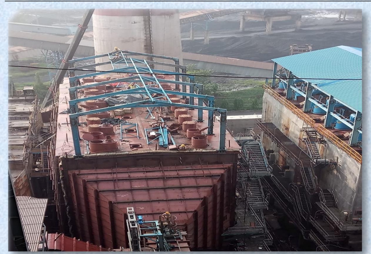
New pass erection successfully completed for NSPCL Durgapur U#1