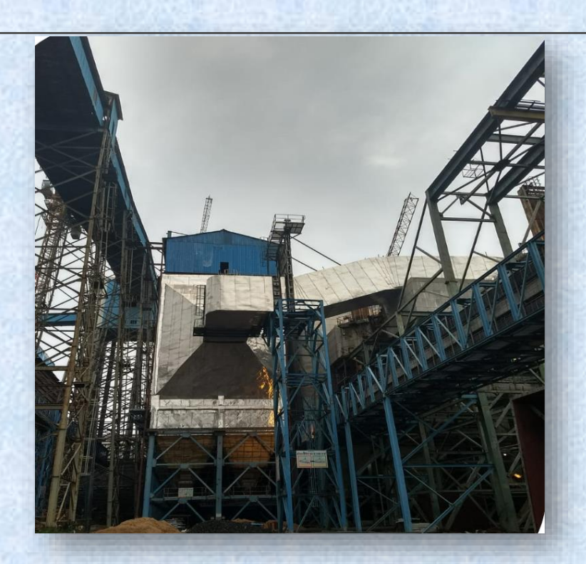
Trial Run Operation of 14 Days & PG test for Ash Handling System successfully completed for Unit # 4 at NTPC Talcher