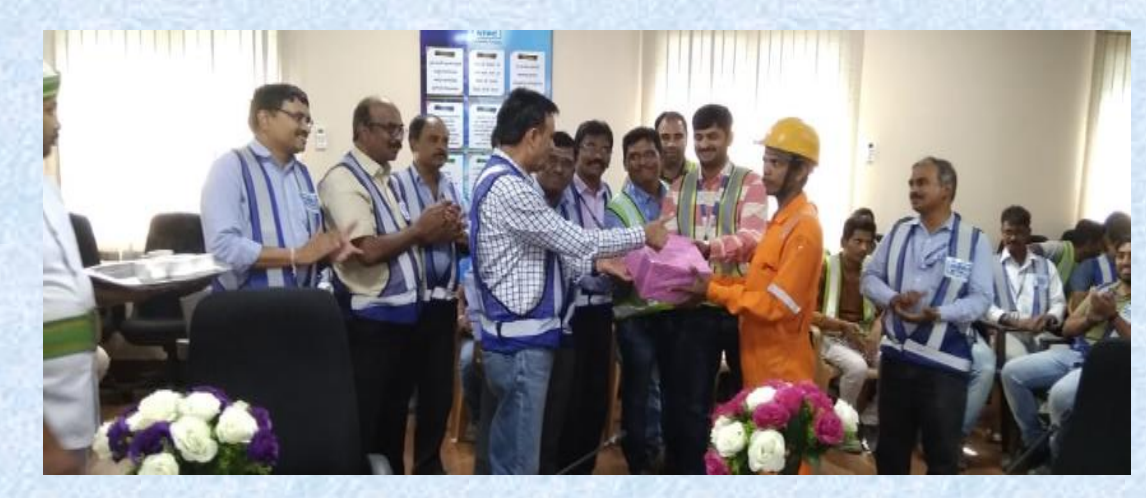
Safety Award received by NGSL Team at NTPC Ramagundam for good EHS practices