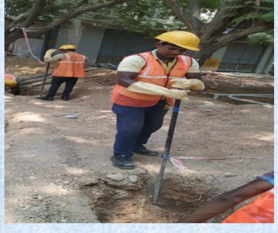
Usage of Underground Live Cable Detector and High-voltage protection gloves