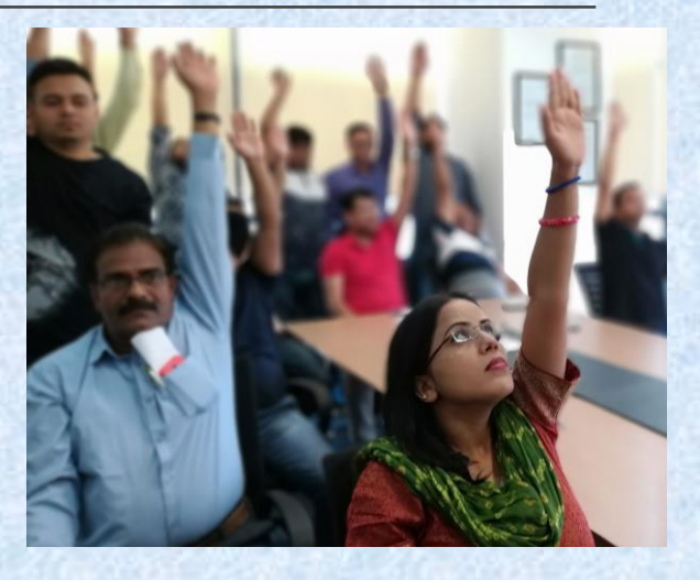
"Yoga For Office" Celebrating the World Yoga Day On 21 June