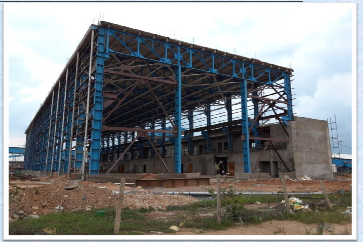
LT Package at NTPC-Gadarwara Site